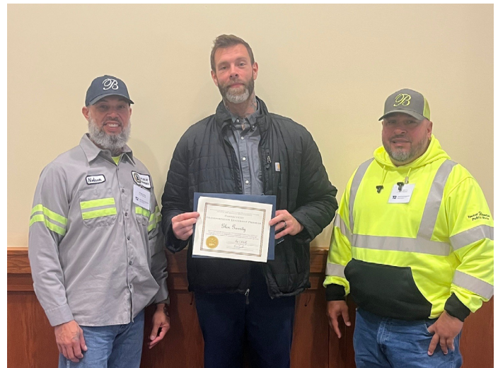
Bloomfield Public Works T2 Transportation Graduates From L-R

The CT T2 Center at UConn is Connecticut's Local Technical Assistance Program, one of 58 local and tribal centers in the United States funded by the Federal Highway Administration and State Departments of Transportation.