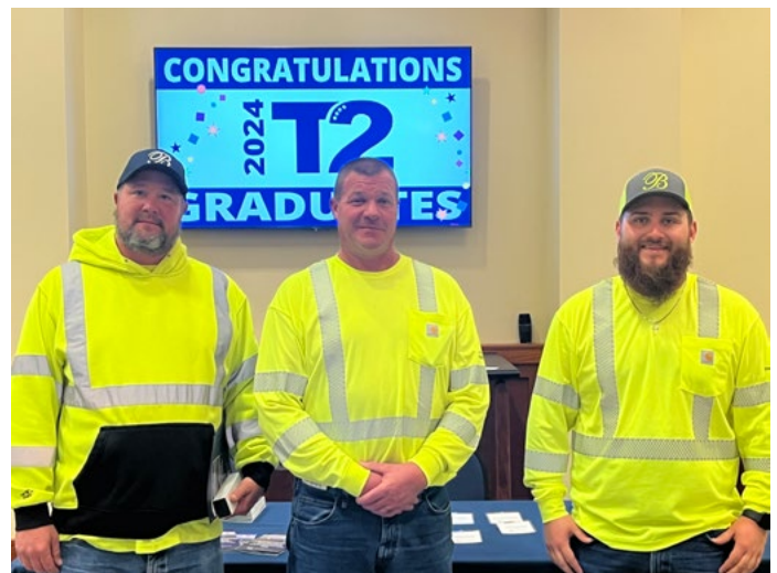
Bloomfield Public Works T2 Transportation Graduates From L-R

Every Town or City in Connecticut has a designated Local Traffic Authority (LTA). LTAs are responsible for many regulatory items on local roads. The first point of contact for any traffic related concern on ANY public road is the LTA. The LTA also works with the CT Department of Transportation (CTDOT) and the Office of the State Traffic Administration (OSTA) on traffic-related matters on State roads.